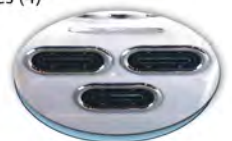
River Stream Jets