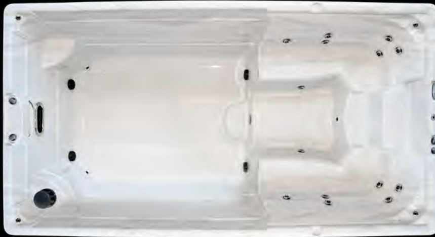
ES14 Shown In Sterling Silver Marble