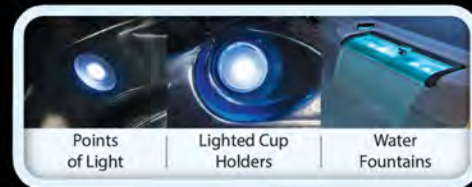
LED Lighting System