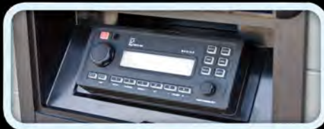
iPod/MP3 Stereo System w/Sub Woofer and Remote Control Standard on "X" Models