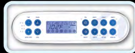
Deluxe Electric Controls