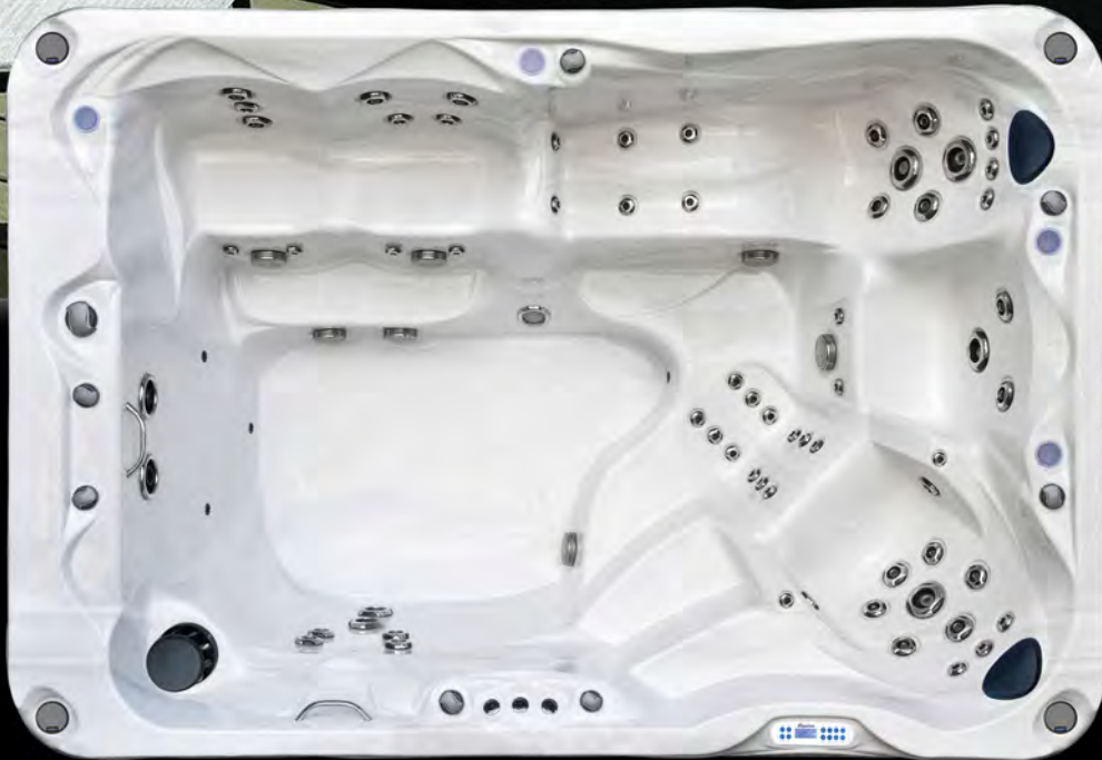
Shown as AQX11 in Sterling Silver Marble

The AQX11 is ideal for aquatic exercise while also providing the benefits of a World Class hydrotherapy hot tub. With the AQX11, you can rejuvenate your muscles in our exclusive Reflexology Seat, luxuriate in the roomy and comfortable lounge, or stand and exercise in one of the two vertical therapy positions. It is conveniently sized and heavily featured to make it an extraordinary ownership investment.