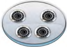
Power Turbo Jets