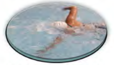
Fitness In Swimming

5 Pumps Deluxe LED Lighting Stainless Safety Handles (1) Inside Entry Steps