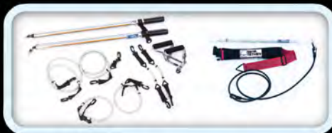
Tether, Rowing and Exercise Band System Standard on "X" Models Excluding AQ11 (No Tether)